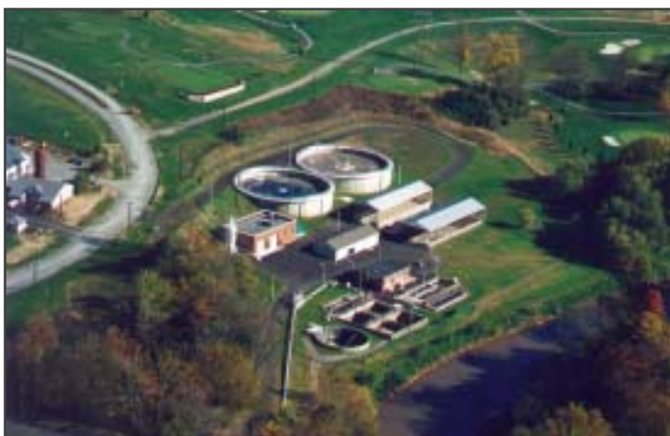
The AquaSBR system was constructed adjacent to the existing plant.

Growth of both the college and Borough community resulted in a significant increase in peak hydraulic loading, as well as BOD and ammonia loadings in excess of the plant's design capacity. This prompted an upgrade to the plant in the late 1970s. The upgrade included the installation of a new final clarifier and new influent equalization basin, and replacement of the existing aeration system.