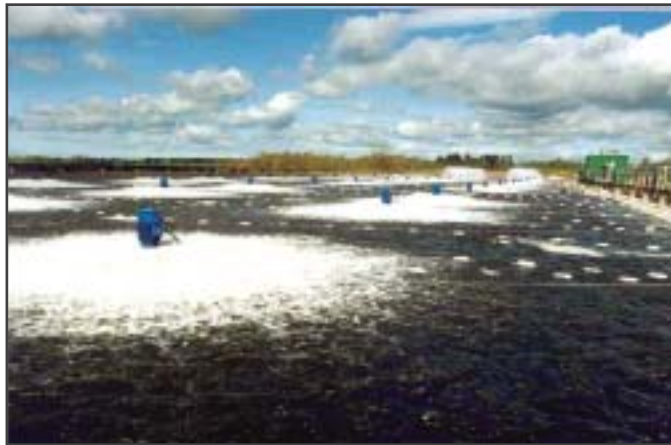
A number of MacLaren's Aqua-Jet aerators in operation. Also shown toward the back are the ThermoFlo spray coolers in an adjacent basin.

MacLaren Industries' kraft pulp mill, located in Thurso, Quebec was built in 1958 and used only a primary treatment process for treatment of its pulp waste until the mid 1990s. It was at this time that more stringent effluent requirements for