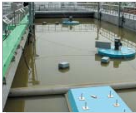
MSBR ® cell at Wuxi New City WWTP in China. Shown are two AquaDDM ® mixers with local control stations and an Air Weir.