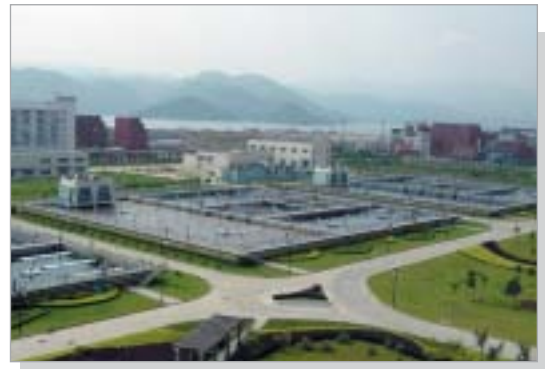
One of four reactors in the MSBR ® system at Shenzhen Yantian WWTP in China.