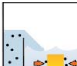
AquaDisk Filter Operation

Clarified effluent flows by gravity through the cloth media of the stationary hollow disks and filtrate exits through the hollow center collection tube.