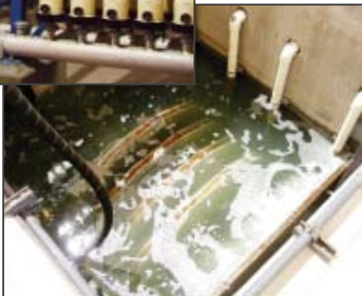
Internal view of one of the AquaDisk Filter units.

The reclaimed effluent produced by the AquaDisk cloth media filters is used for park and golf course irrigation, and to fill Fountain Lake, which exhibits the highest fountain in the USA. A portion of the filters' effluent is also distributed to the membrane system to produce microfiltered effluent for injection into deep wells for ground water recharge. This allows 2.0 MGD of water to be stored when the demand for water is low (i.e. winter) and have it available when the demand is high (i.e. summer).