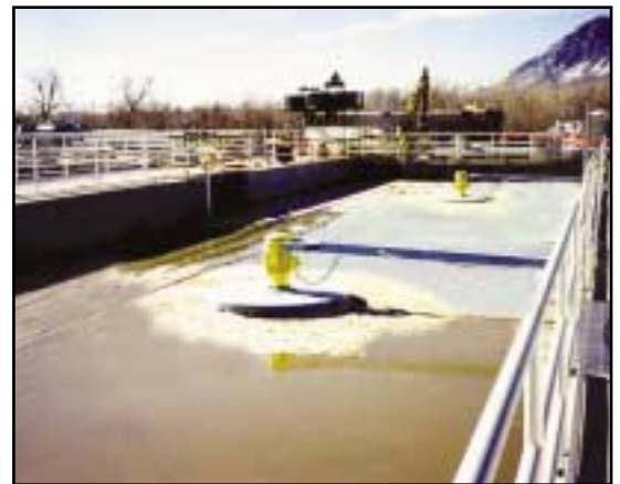
One of five anoxic basins utilizing AquaDDM mixers with a pivotal mooring arm.