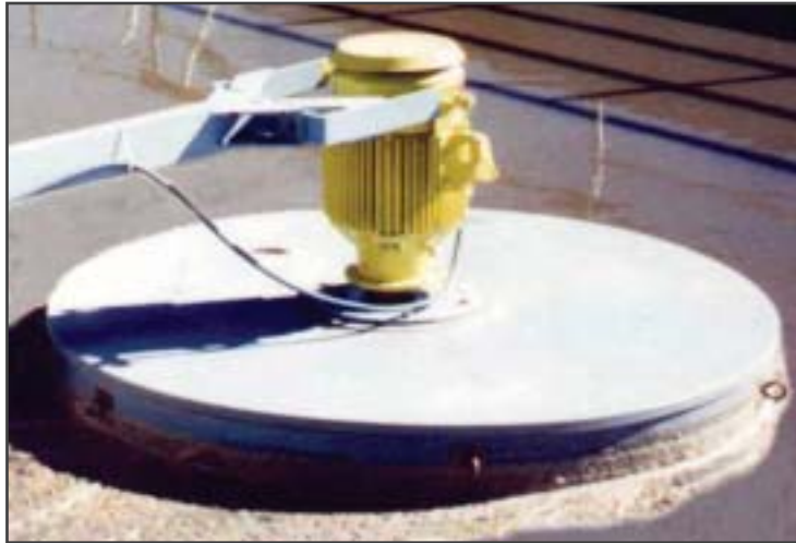
A typical 3 HP AquaDDM mixer

Because the activated sludge system alone could not meet stringent Total N requirements of 5 mg/l, Brighton decided to expand its plant in 1989. It first installed a cement tank to improve settling characteristics but discovered it was not successful in the required reduction of nitrates. The need for mixers was inevitable so the plant then turned to Aqua-Aerobic Systems, Inc. to solve its denitrification problem.